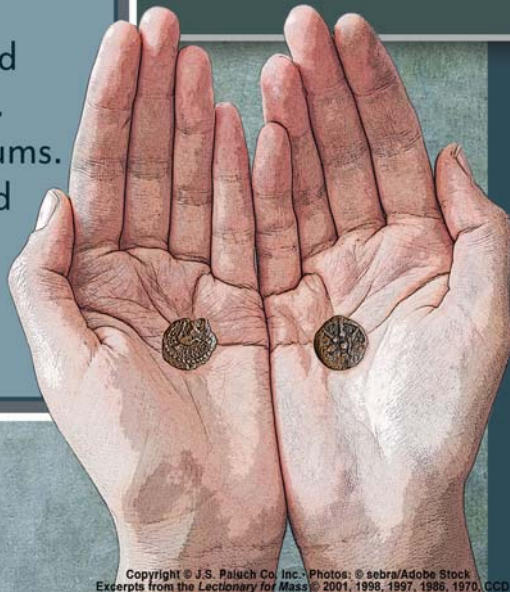
Copyright © J.S. Paluch Co. Inc. Excerpts from the Lectionary for Mass © 2001, 1998, 1997, 1988, 1970, C.C.D.