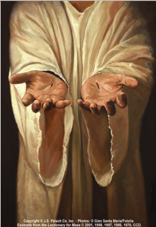
Copyright © J.S. Paluch Co. Inc. - Excerpts from the Lectionary for Mass © 2001, 1998, 1997, 1986, 1970, CCD.

One Depan Avenue Floral Park, NY 11001 Website: sthedwig.church E-mail: contact@sthedwig.church Tel. (516) 354-0042 Fax: (516) 327-2458