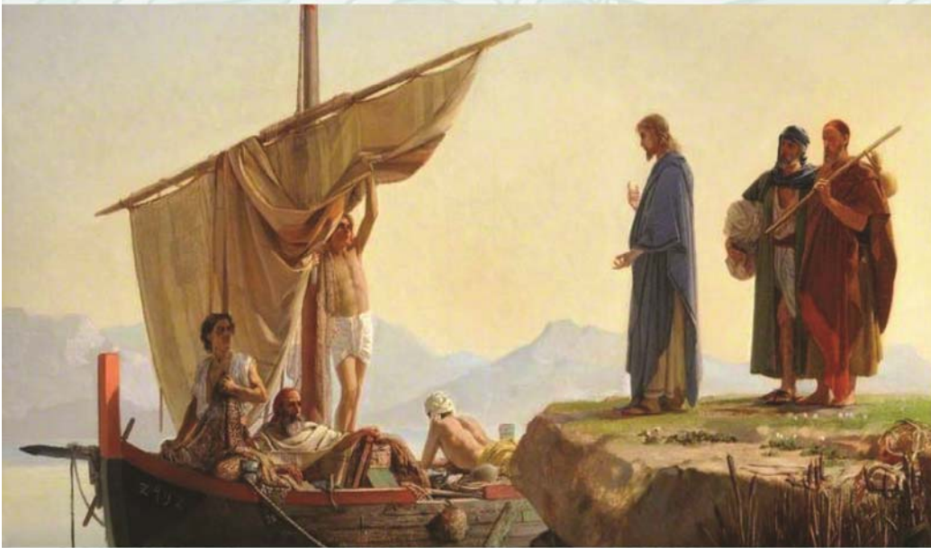
COPYRIGHT © J.S. PALUCH CO., INC. EXCERPTS FROM THE LECTIONARY FOR MASS © 2001, 1998, 1997, 1986, 1970, CCD.

THEY ABANDONED THEIR NETS AND FOLLOWED JESUS. - MARK 1:18