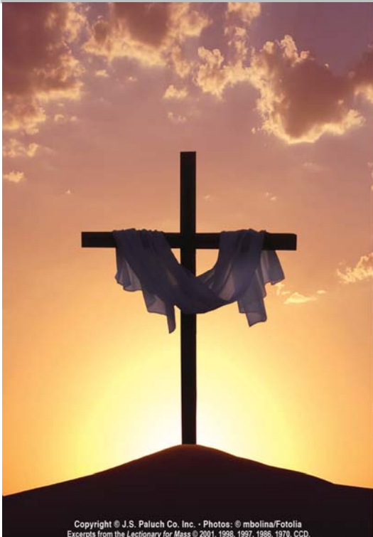
Copyright © J.S. Paluch Co. Inc. Excerpts from the Lectionary for Mass © 2001, 1998, 1997, 1986, 1970, CCD.

One Depan Avenue Floral Park, NY 11001 Website: sthedwig.church E-mail: contact@sthedwig.church Tel. (516) 354-0042 Fax: (516) 327-2458